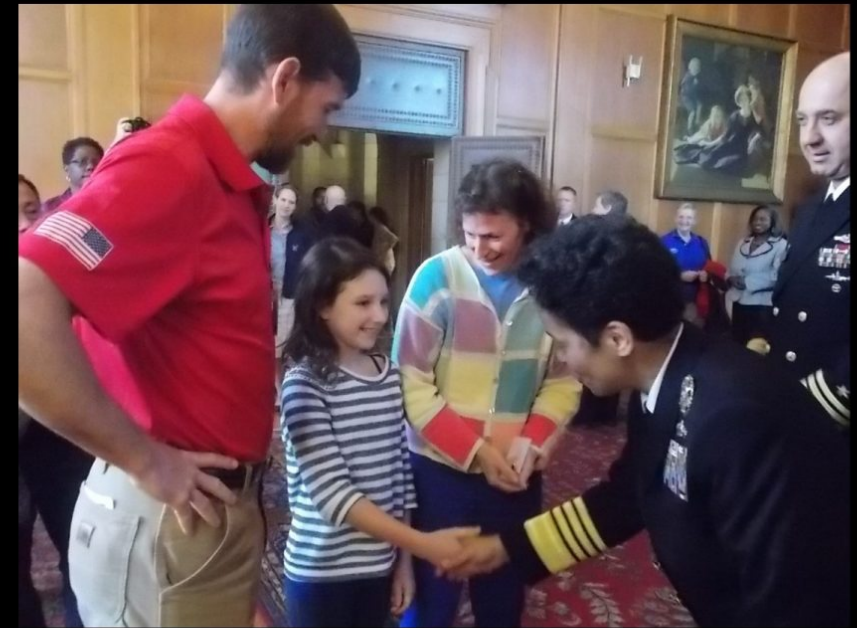
Women of Color CNG/PCCW/VCNG/Team RWB/Tri-Service ROTC Adm. Michelle J. Howard, Veterans Day Ceremony 2014